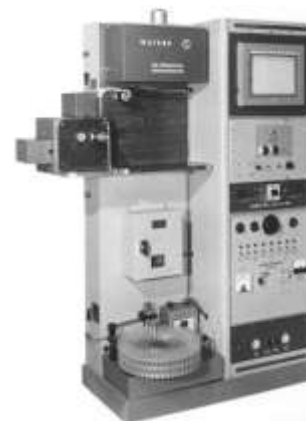
GPC-200 - 1962