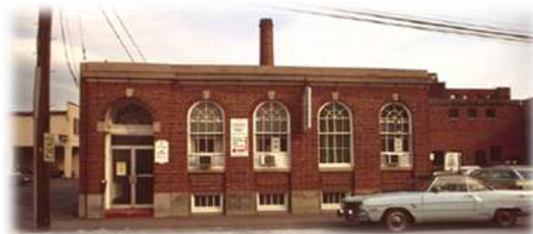
Waters Associates - 1958